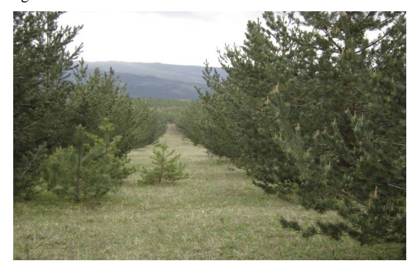
Figure 2. Scots pine seed orchard established at Mengen, Bolu, with spacing 7x 7 m., 1034 grafts from 30 clones selected from a seed collection stand in 1988.