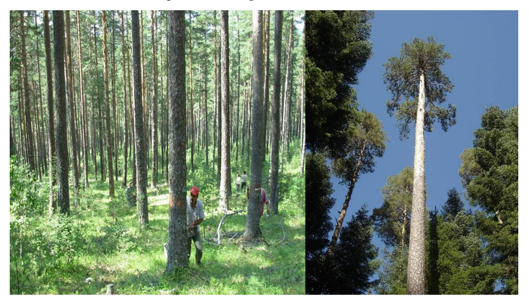
Figure 3. Seed collection stand (left) where a plus tree was selected (right) (1300 m).

Scots pine has 36 seed collection stands, ( Figure 1 ) in 4813 ha, selected phenotypically such as stem and crown forms, small branch ( Figure 3 ). The general characters of the stands of the species were given in Table 3 .